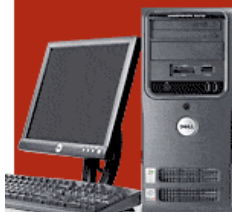
Dimension™ E310 with 17" Flat Panel