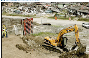
Katrina's devastation in News Orleans surrounds workers rebuilding levees Tuesday. Leaders hope the levees, and the U.S. response system, are ready for the next hurricane season.

VIDEO | Sen. Panel Recommends Nixing FEMA