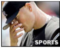
Rockies' Revenues Are Vanishing