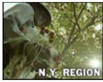
The Power of Monuments