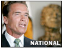
Schwarzenegger Calls Special Election