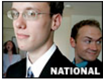
Next Generation of Conservatives