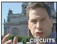
Video: David Pogue Geek Cruise