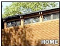
Build Me a Bargain