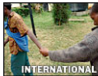
Kenyan Village Confronts Alcohol