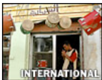
Shiite Morality in Iraq Oil Port