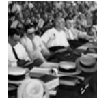
Bryan at Scopes Trial, 1925 Buy Now