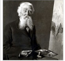
Preserving the Home of Thomas Moran

Home | World | U.S. | N.Y. / Region | Business | Technology | Science | Health | Sports | Opinion | Arts | Style | Travel | Jobs | Real Estate | Automobiles | Back to Top