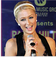
A Crowd of Professional Amateurs