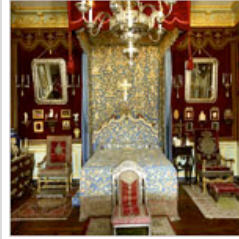
A Fixer-Upper the Sun King Would've Loved