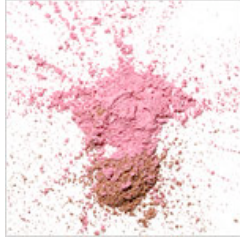
Makeup, Excavated From a Mine