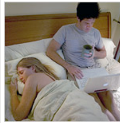
Laptop Slides Into Bed in Love Triangle