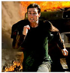
A New Mission for Tom Cruise: Be Likable