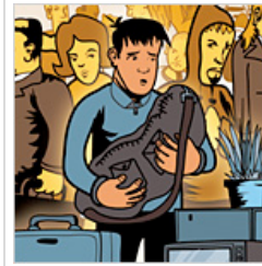
The Housing Virgins of Manhattan

Talking Points: America's Crumbling Infrastructure